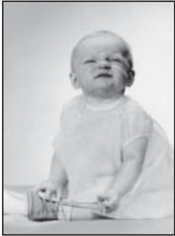
Fiesty in 1954

SOME OF DARLENE'S MYRIAD FACETS ARE CAPTURED BELOW: