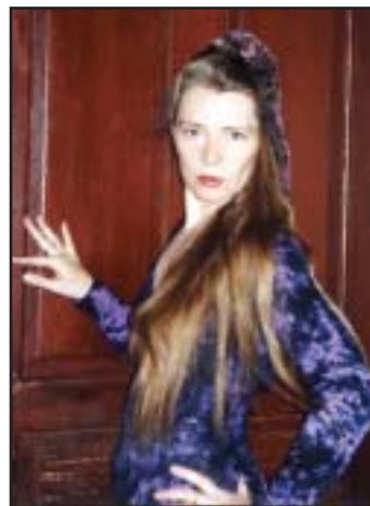
Morticia in 2001