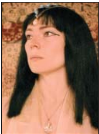
Egyptian in 1990