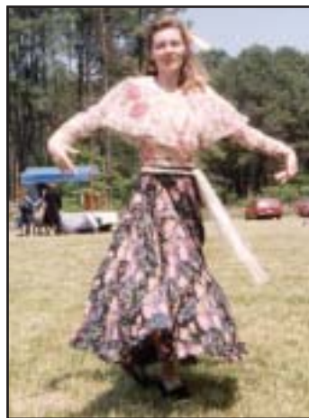
Dancing in 1995