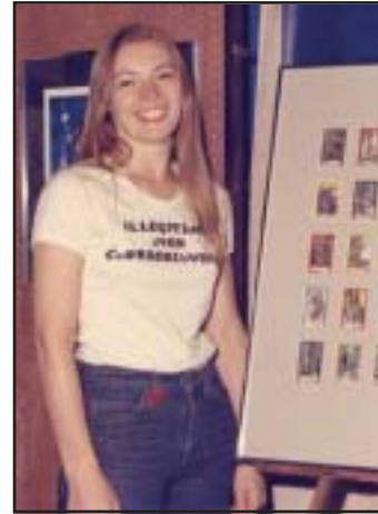
Triumphant in 1984