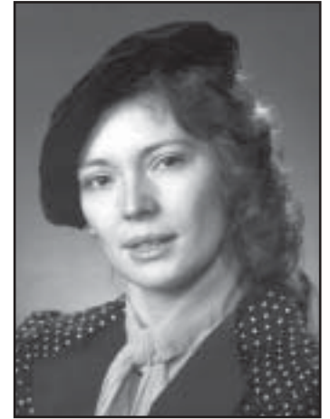
Professional in 1988