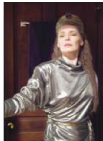
Priestess in 2006