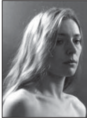
Dramatic in 1978